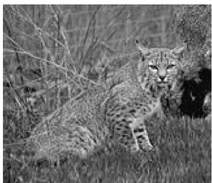
A Bobcat is about twice the size of a house cat.

Coyotes and Bobcats have recently been seen in this area. It is advisable to keep all pets indoors especially if one of these wild animals can access your back yard. A Bobcat can easily take down a house cat or a small dog. Coyotes have regularly gotten "out-door" cats and small dogs. Remember they were here first and this is their home.